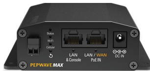
MAX BR1 Mini