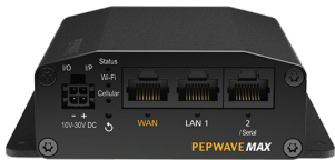
MAX BR1 Classic